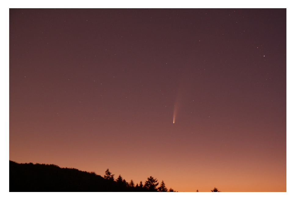
Figure 1: Comet C/2020 F3 (NEOWISE).

Comet C/2020 F3 (NEOWISE) is a visitor that usually stays far away from the Sun. With an aphelion at about 700 au (more than 100 billion km!) it takes the comet more than 6000 years to complete an orbit around the Sun. At its perihelion it has an orbital velocity of 77.6 km/s, just 16 m/s too slow to escape from the solar system. But quite some dust that it ejects before or after its perihelion passage on 3 July 2020 will leave our solar system.